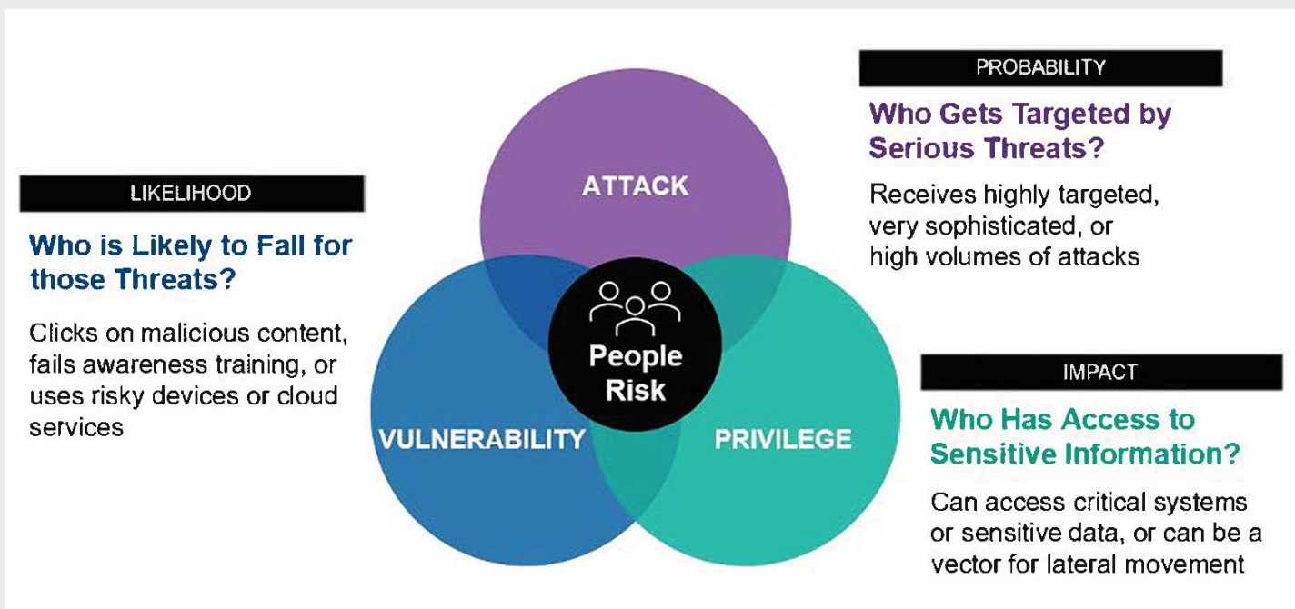
Figure 1: Venn Diagram showing how Proofpoint views the variables that intersect to inform risk.